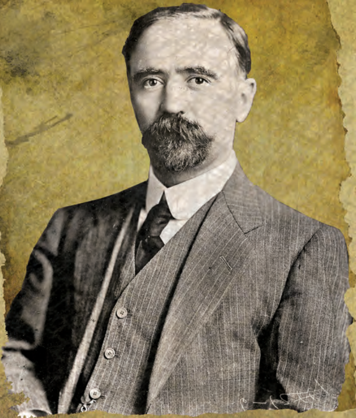
FRANCISCO I. MADERO