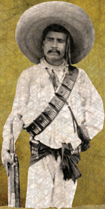
PEASANT FROM MORELOS