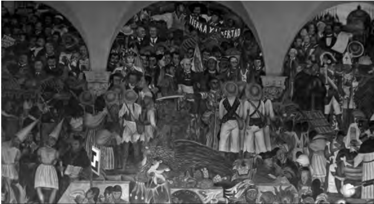
Image: Provided by Fototeca-INAH. Núm. 4851 | "Palacio Nacional, mural del arco central realizado por Diego Rivera"