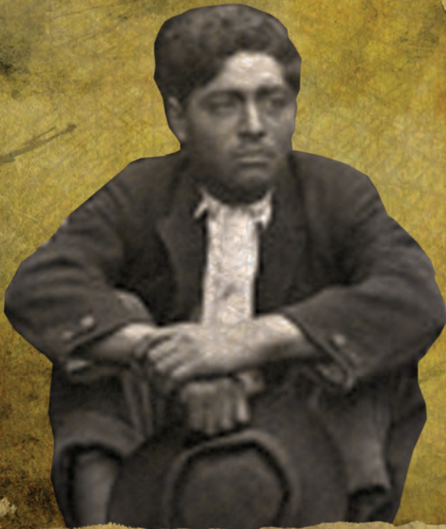
LABORER FROM VERACRUZ