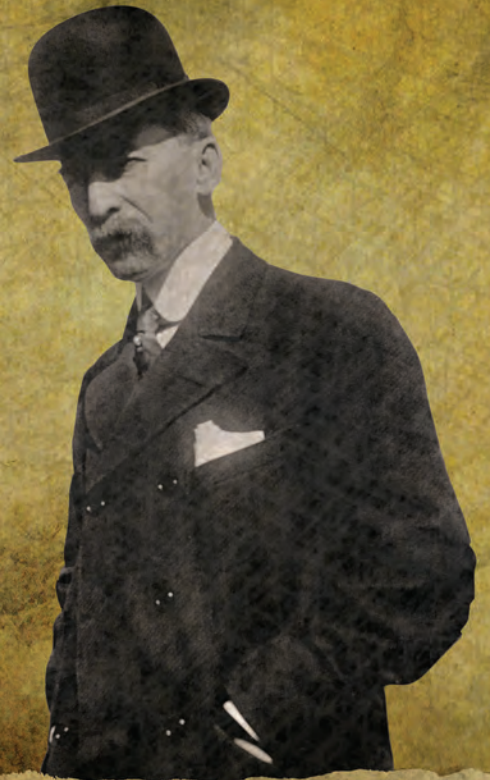
U.S. AMBASSADOR HENRY LANE WILSON