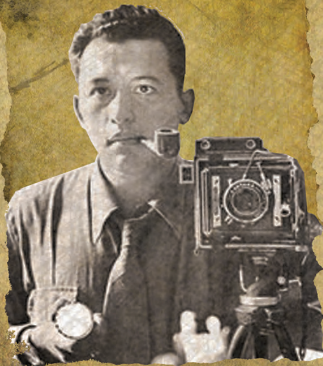
AGUSTÍN VÍCTOR CASASOLA