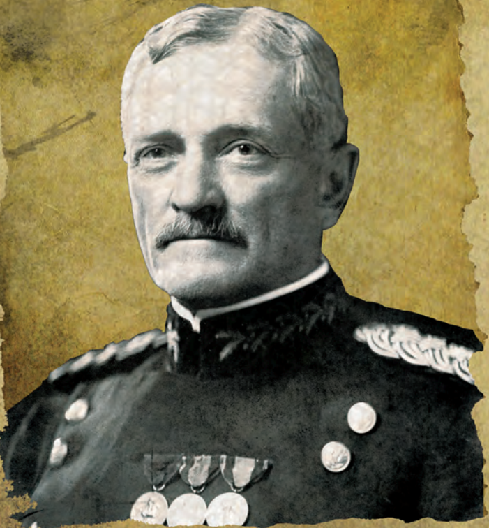
JOHN J. PERSHING