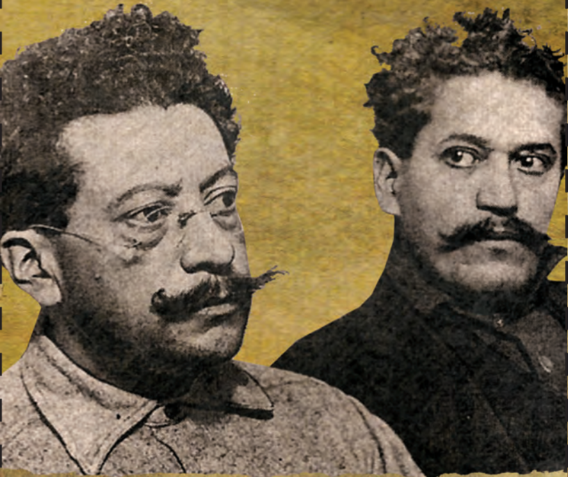
FLORES MAGÓN BROTHERS