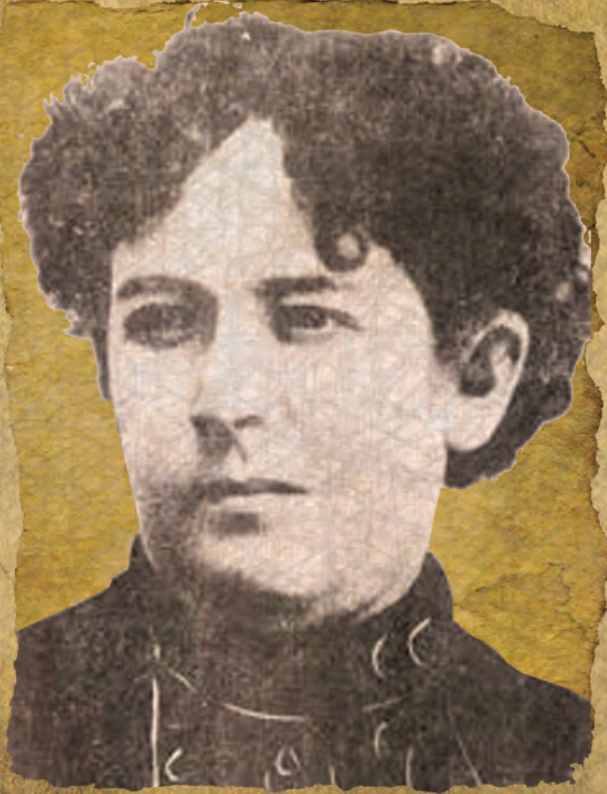
DOLORES JIMÉNEZ Y MURO