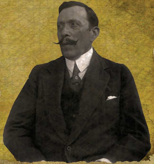
WEALTHY LANDOWNER FROM SONORA