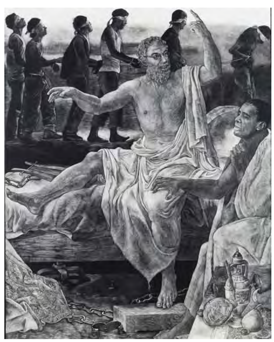
Altar Parsioneros, 2010 | Sgraffito on wood panels with acrylic and acrylic ink Alice Leora Briggs | Courtesy of Evoke Contemporary, Santa Fe, New Mexico

UNM Art Museum | UNM Latin American & Iberian Institute March 26, 2013