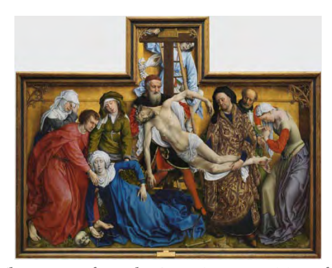
The Descent from the Cross (or, Deposition of Christ) c. 1787 | Rogier van der Weyden

The Magdalen Reading is a "fragment cut from a larger painting, evidently an altarpiece of the Virgin and Child with Saints. It shows Mary Magdalene, with Saint Joseph behind, and the bare feet and red robe of Saint John the Evangelist on the left. The jar in the foreground contains the ointment which Mary Magdalene used to anoint Jesus' feet as she wept over them, repenting of her sins. She subsequently devoted her life to holy works, and is represented reading a holy book. Her clothes are sumptuous: her fur-lined dress is turned back to reveal a bejewelled underdress. The wooden cupboard suggests that the scene was set in a rich domestic interior. The background includes a detailed landscape view."<sup>2</sup>