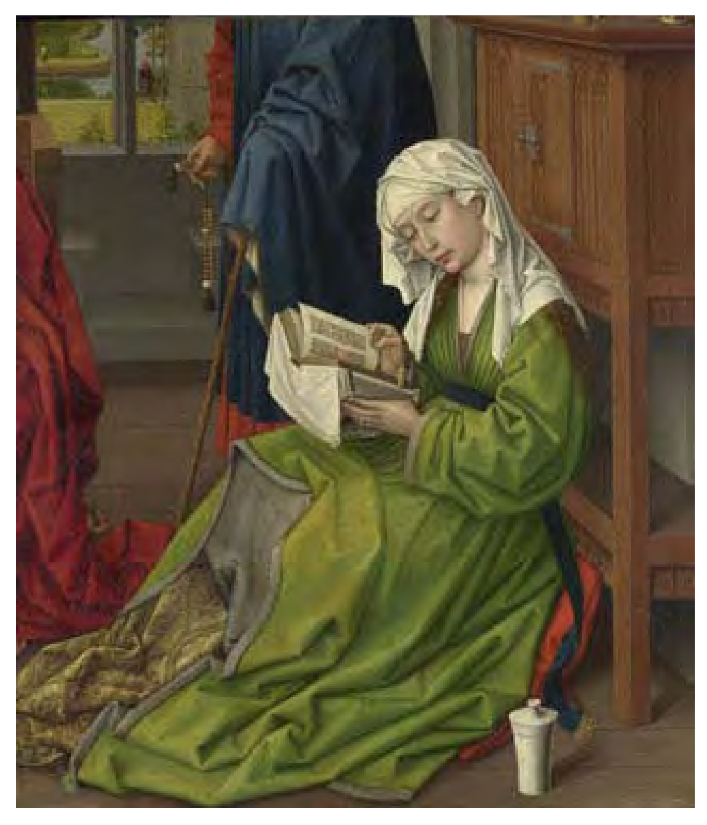
The Magdalen Reading, before 1438 | Rogier van der Weyden