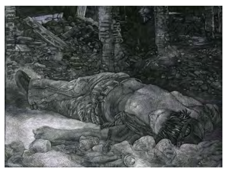
El Cholito , 2008 | Sgraffito on wood panel | Alice Leora Briggs