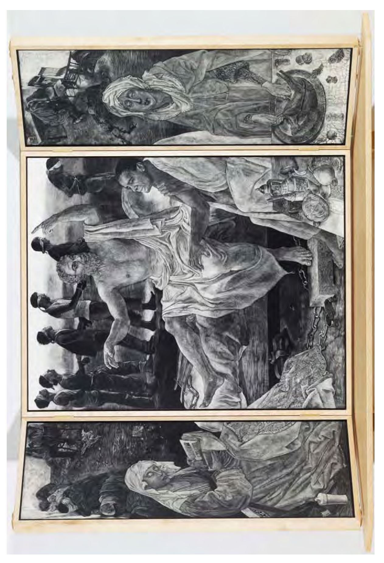
Altar Parsioneros , 2010 | Sgraffito on wood panels with acrylic and acrylic ink | Alice Leora Briggs | Courtesy of Evoke Contemporary, Santa Fe, New Mexico