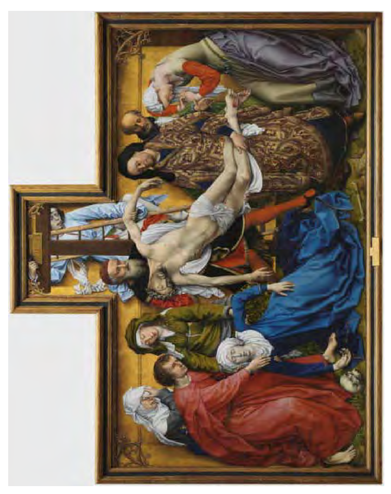
The Descent from the Cross (or, Deposition of Christ) c. 1787 | Rogier van der Weyden