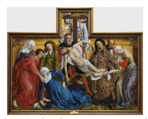
The Descent from the Cross (or, Deposition of Christ) c. 1787 | Rogier van der Weyden

The Magdalen Reading is a "fragment cut from a larger painting, evidently an altarpiece of the Virgin and Child with Saints. It shows Mary Magdalene, with Saint Joseph behind, and the bare feet and red robe of Saint John the Evangelist on the left. The jar in the foreground contains the ointment which Mary Magdalene used to anoint Jesus' feet as she wept over them, repenting of her sins. She subsequently devoted her life to holy works, and is represented reading a holy book. Her clothes are sumptuous: her fur-lined dress is turned back to reveal a bejewelled underdress. The wooden cupboard suggests that the scene was set in a rich domestic interior. The background includes a detailed landscape view."<sup>2</sup>