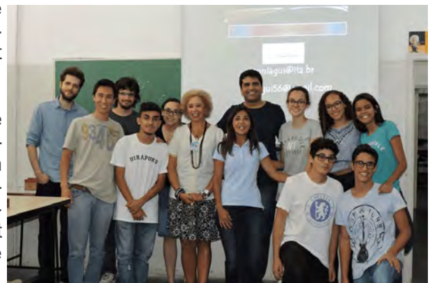
Visit of students from Uirapuru school to ITA

After the movie Hidden Figures was released, which tells the story of NASA's human computers that were Black mathematical women, a daring search for pioneer Black women began and my name came up. With this recognition, I became famous, and I have since been giving lectures throughout Brazil. However, there is an upcoming women-led conference at ITA planned for March 2020, yet no one thought of inviting me to be part of the organizing committee — let alone to give a lecture. However, I have been invited for social activities like coffee breaks. One day, one of the teachers came to ask me to join them. I responded by asking that if they wanted me around, why didn't they invite me to join the organizing committee for the women-led conference? Answer: "since they are new to ITA and they don't know me, I shouldn't be asking this type of question."