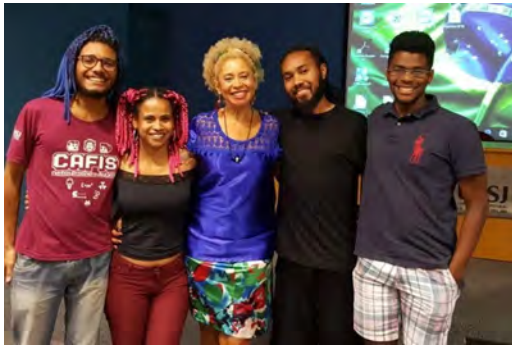
Registration after lecture at the Federal University of Sao Joao Del Rei

As if violence were not enough , the ex-coordinator of the course I am teaching this semester is boycotting my course. I could have retired in August, but I only teach classes for the 1st year, in the 2nd semester, and this is the 1st year of racial quotas at ITA, and I wanted to teach classes for the Black students who entered. Well, I asked the students to do a certain task, and the coordinator told them not to do it. One class did a great job so I gave them a good grade, but the other class did nothing so I gave them a low grade; however, the coordinator forbade me to evaluate those who had done nothing.