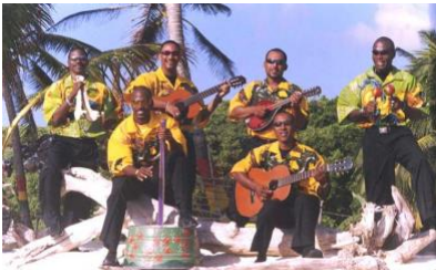
Figure 1 El Creole band

For the first activity, let’s listen to the following songs from the San Andres Islands. As you listen, use the spaces to write down any words you recognize.