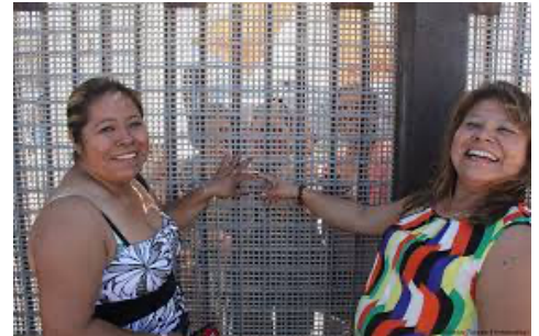
This image shows family members on both sides of the border in Friendship Park.

Key Themes: Themes that are essential to this story include: (1) the power of art: while visiting with Abuela and trying to get their presents to her through the fence, the border patrol stop María and explain that it is prohibited to pass things through the fence; however, upon seeing Juan's drawing, the border patrol agent's stance changes. (2) migration and borders: the U.S. - Mexico border is a central element to this story; this story can facilitate discussions about immigration and the challenges that families divided by political borders endure.