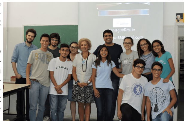
Visit of students from Uirapuru school to ITA

After the movie Hidden Figures was released, which tells the story of NASA's human computers that were Black mathematical women, a daring search for pioneer Black women began and my name came up. With this recognition, I became famous, and I have since been giving lectures throughout Brazil. However, there is an upcoming women-led conference at ITA planned for March 2020, yet no one thought of inviting me to be part of the organizing committee — let alone to give a lecture. However, I have been invited for social activities like coffee breaks. One day, one of the teachers came to ask me to join them. I responded by asking that if they wanted me around, why didn't they invite me to join the organizing committee for the women-led conference? Answer: "since they are new to ITA and they don't know me, I shouldn't be asking this type of question."