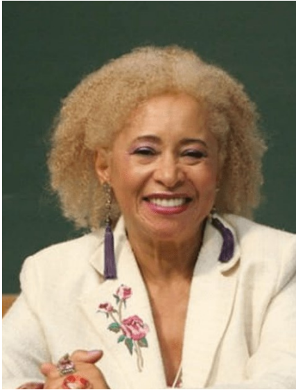
Image of Guimarães from: Catarinas.info article featured in this lesson plan.

Before watching the TED Talk: Use your prior knowledge or take an educated guess to answer the questions below.