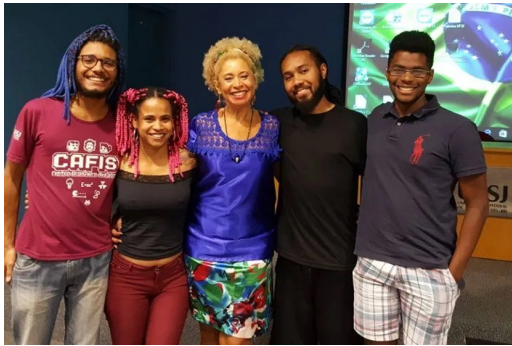
Registration after lecture at the Federal University of Sao Joao Del Rei

As if violence were not enough , the ex-coordinator of the course I am teaching this semester is boycotting my course. I could have retired in August, but I only teach classes for the 1st year, in the 2nd semester, and this is the 1st year of racial quotas at ITA, and I wanted to teach classes for the Black students who entered. Well, I asked the students to do a certain task, and the coordinator told them not to do it. One class did a great job so I gave them a good grade, but the other class did nothing so I gave them a low grade; however, the coordinator forbade me to evaluate those who had done nothing.