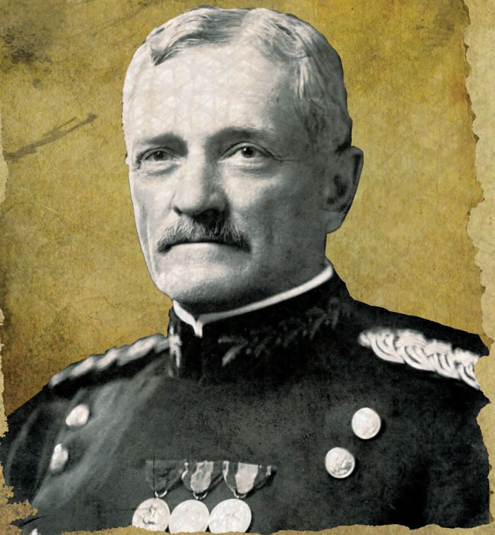
JOHN J. PERSHING