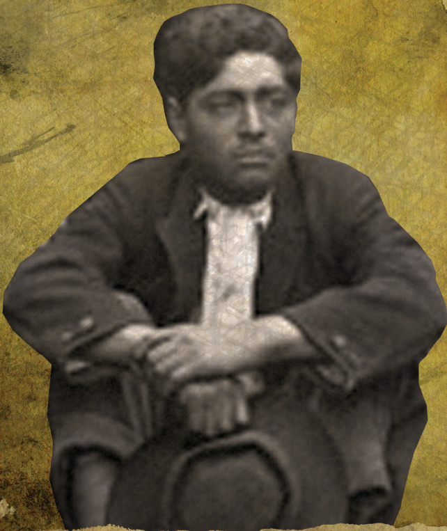
LABORER FROM VERACRUZ