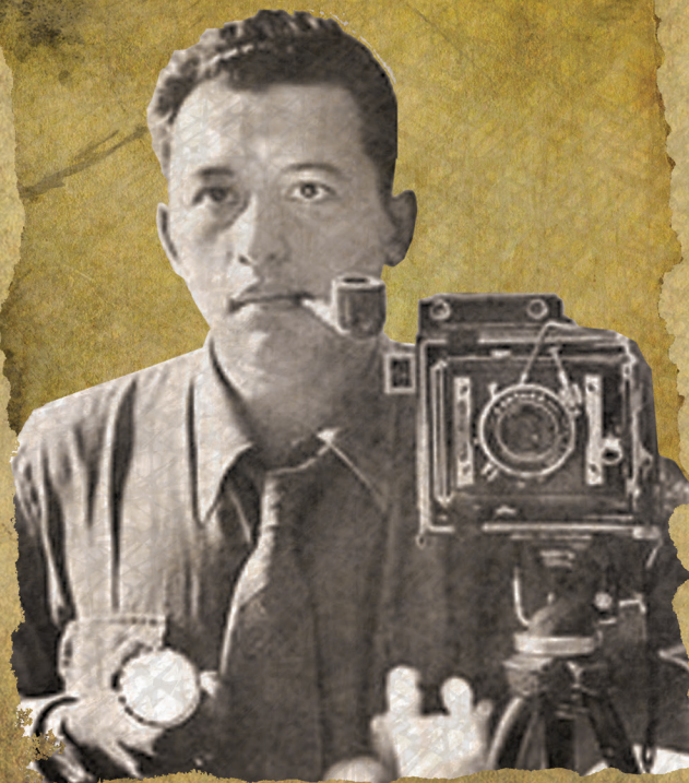
AGUSTÍN VÍCTOR CASASOLA