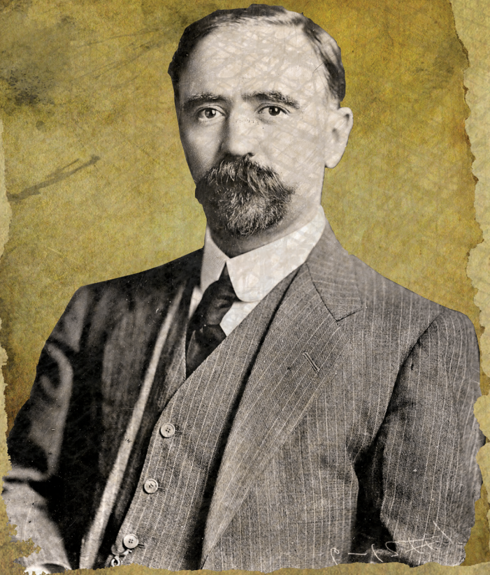
FRANCISCO I. MADERO