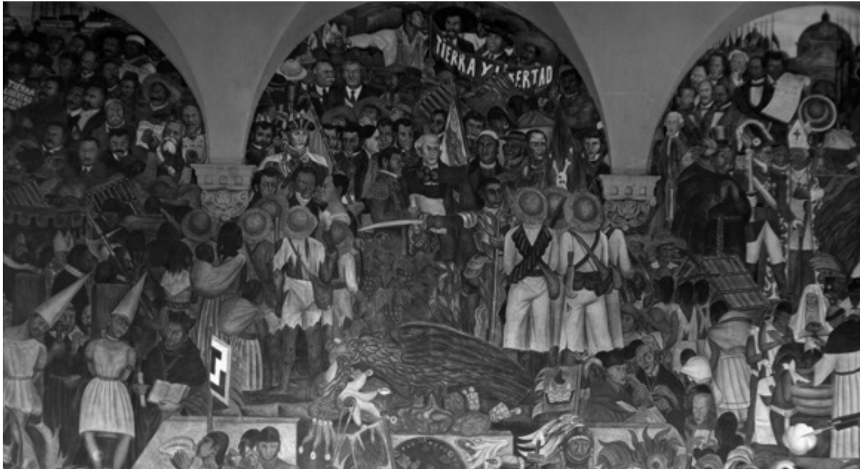
Image: Provided by Fototeca-INAH. Núm. 4851 | "Palacio Nacional, mural del arco central realizado por Diego Rivera"