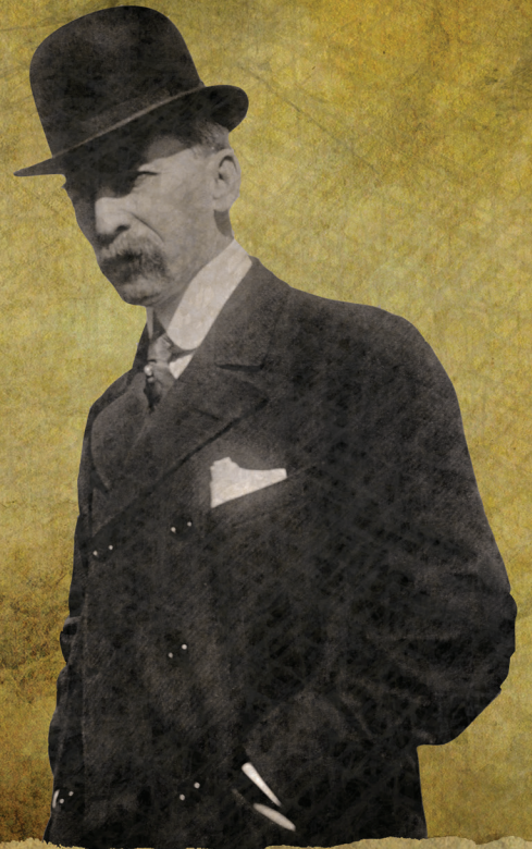
U.S. AMBASSADOR HENRY LANE WILSON