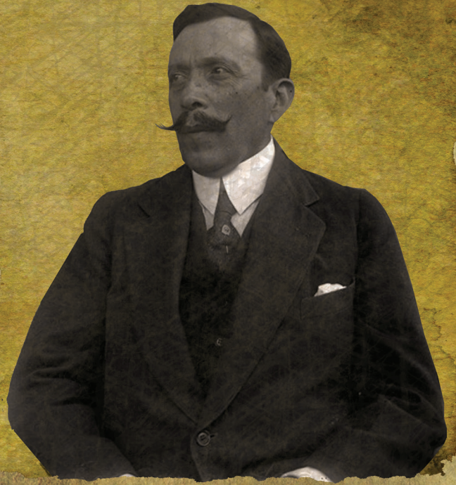
WEALTHY LANDOWNER FROM SONORA